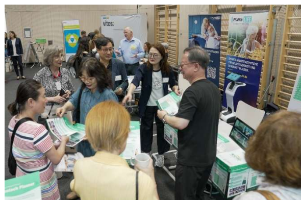
Figure 6: Part of the Exhibition