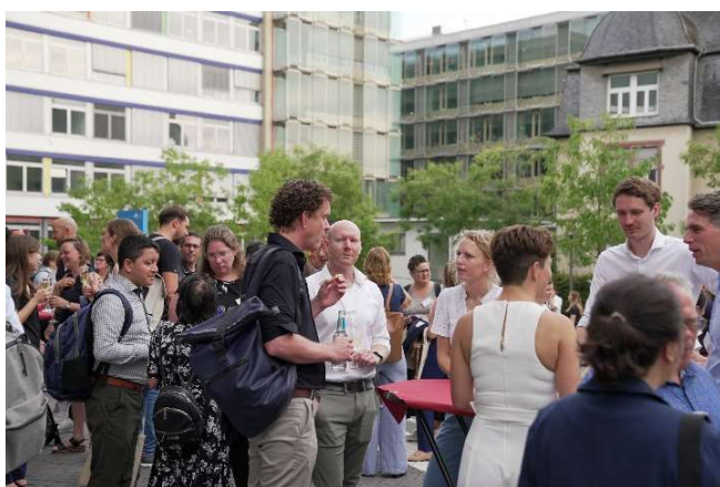
Figure 5: Welcome Reception