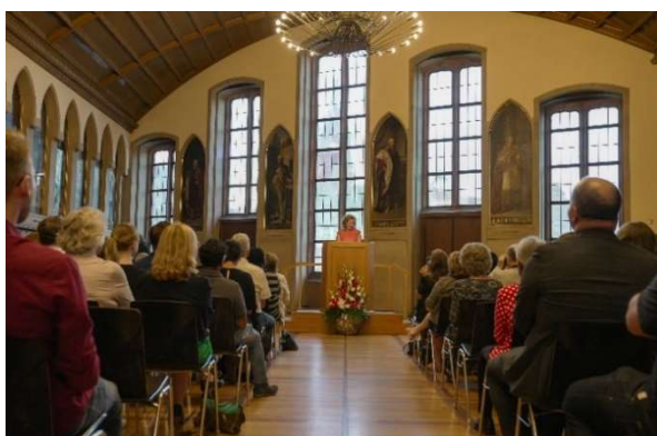
Figure 7: Reception at the Römer