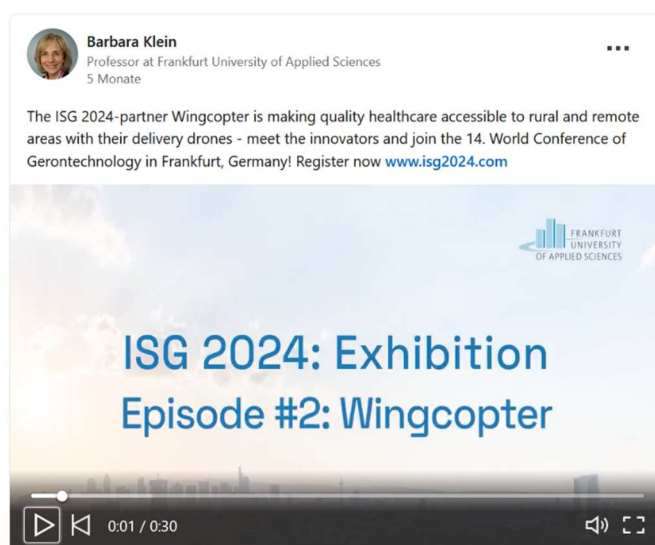
Figure 2: LinkedIn Post ISG 2024 Exhibition Video