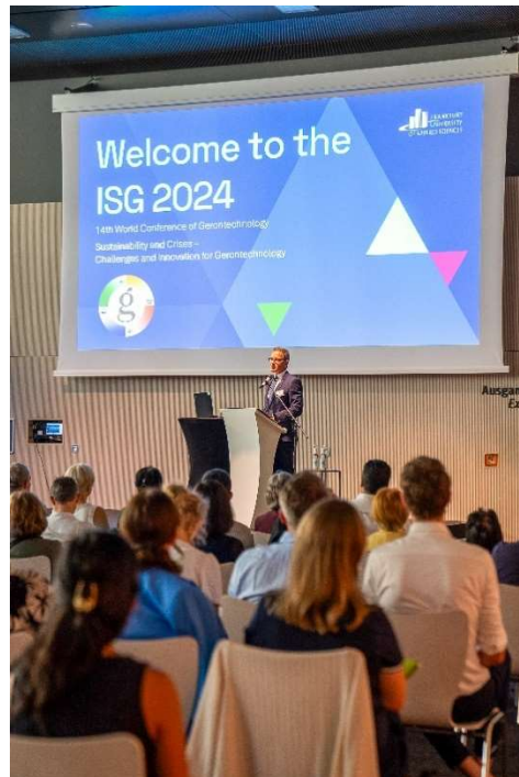
Figure 4: Welcome to the ISG 2024